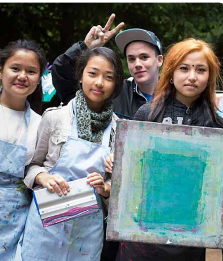
Left: 'Big Ideas Day' participants Opposite: Great Barn, Basing House