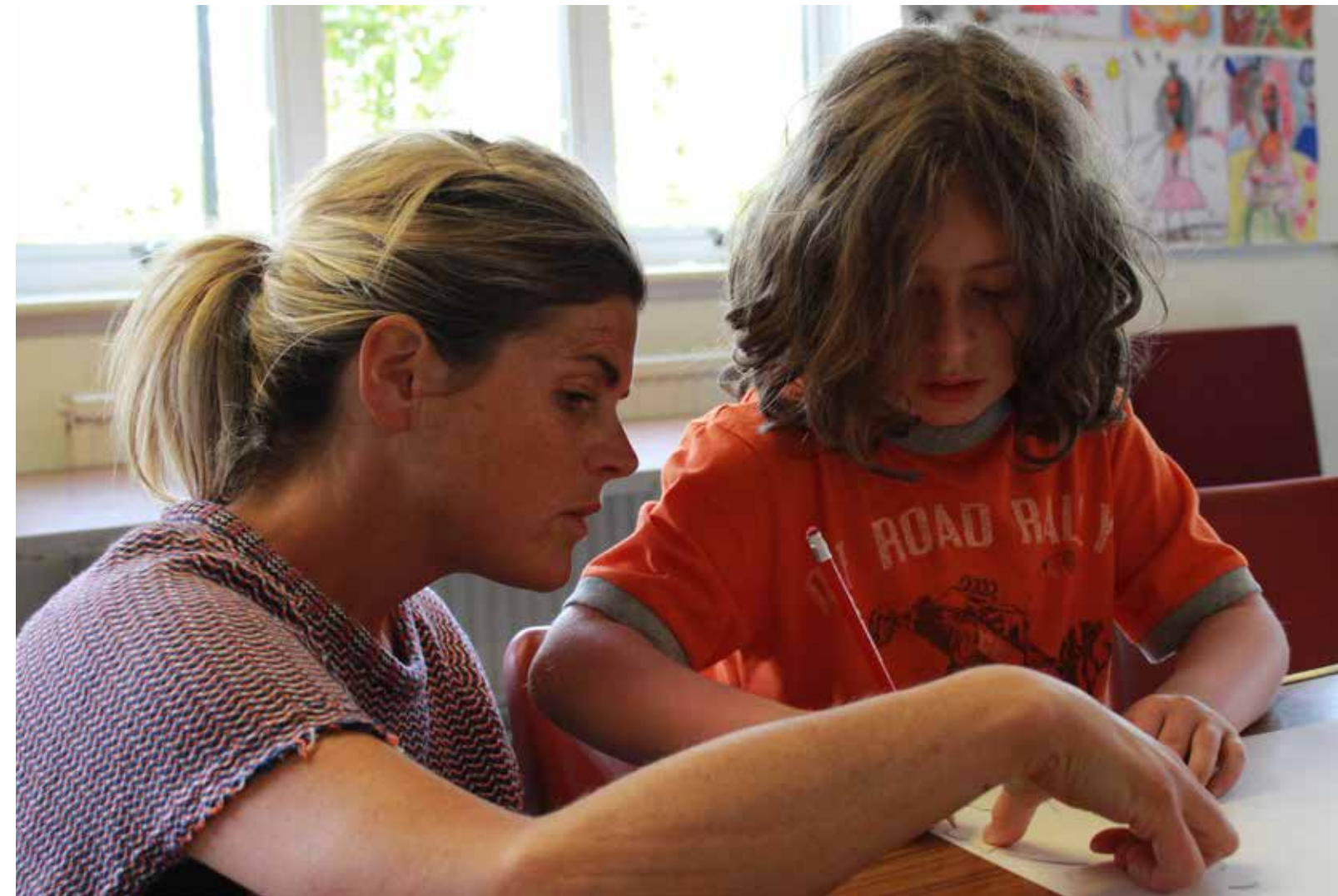
Opposite: Mini Art Club, Forest Arts Centre